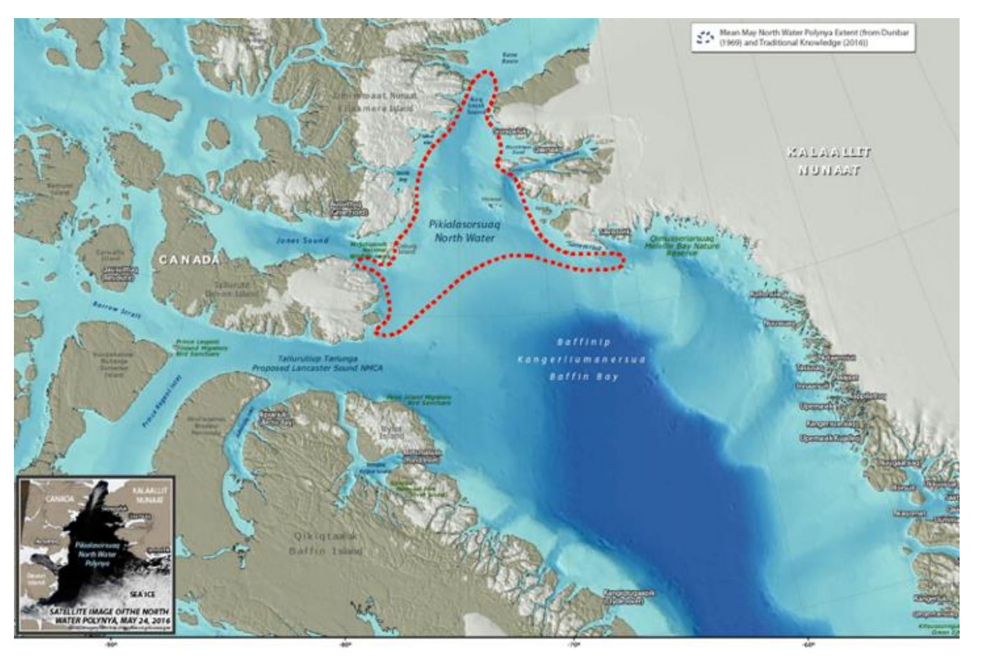
Map of Pikialasorsuaq between Nunavut, Canada and Greenland