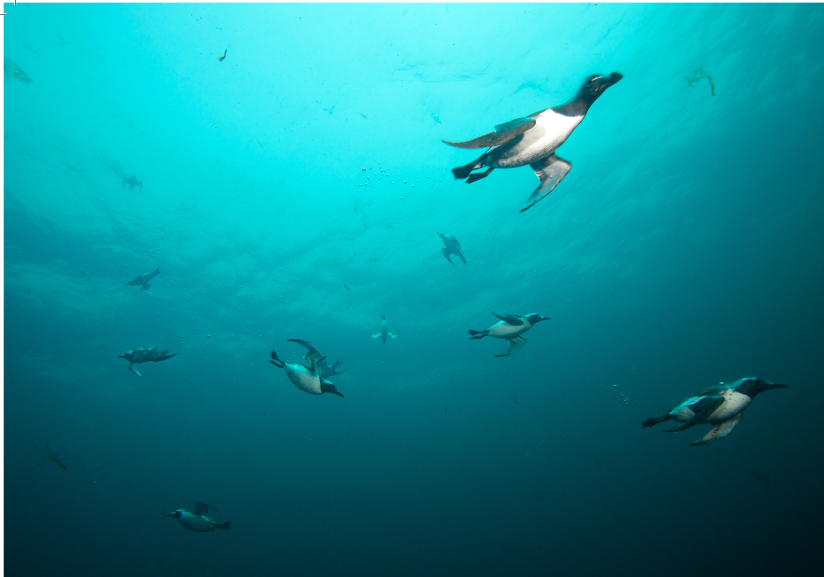
Auk in foreground and guillemots in the background.

steps and foundations for the production of integrated assessment reports for various Arctic LMEs.