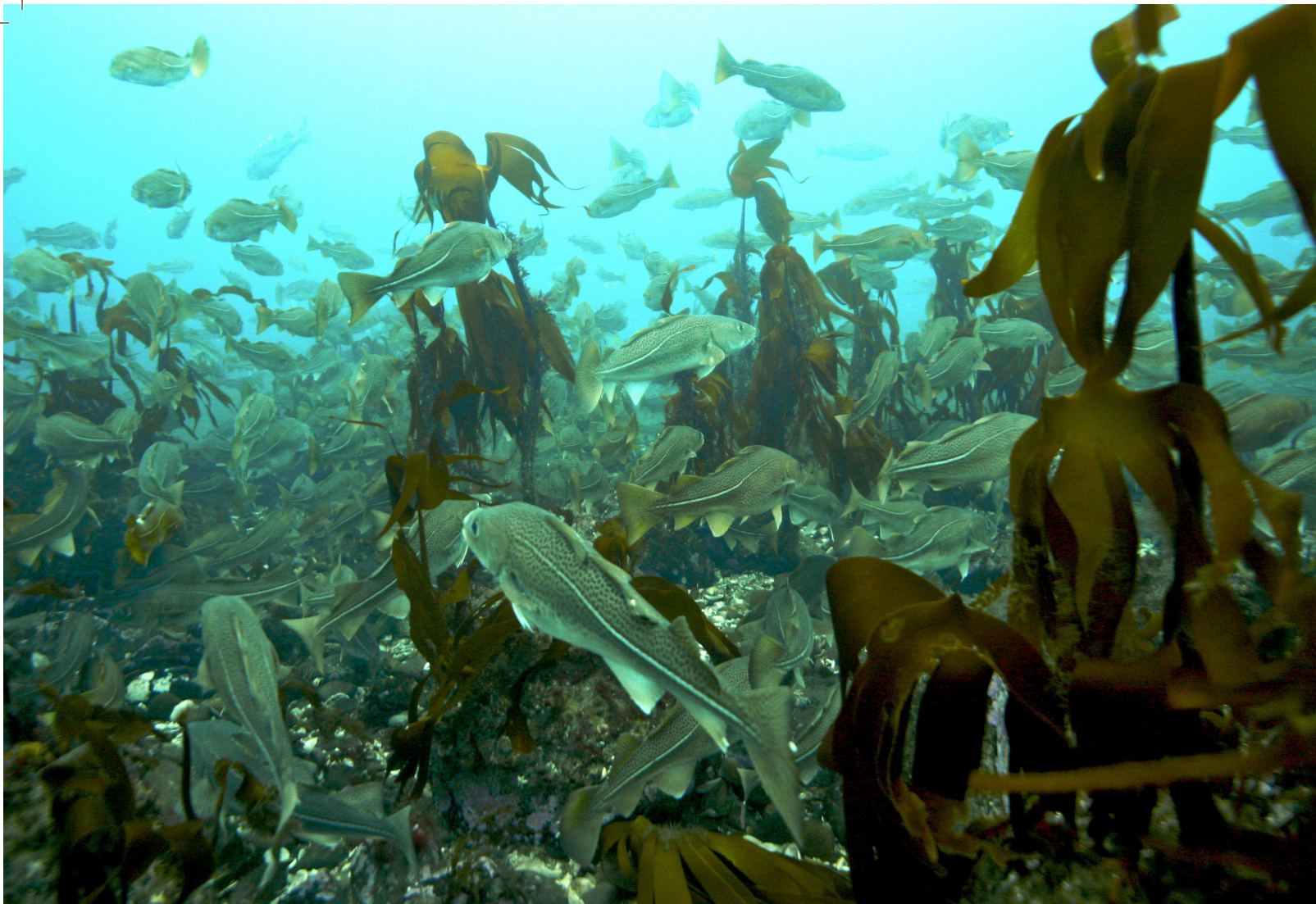
Atlantic cod ( gadus morhua ).

birds). These larger scale migrations need clearly to be taken into account in the management of the migratory species. One way this can be done is to focus on the relationship between the migratory animals and specific habitats and food web interactions in each of the Arctic LMEs they are frequenting during their seasonal visits.