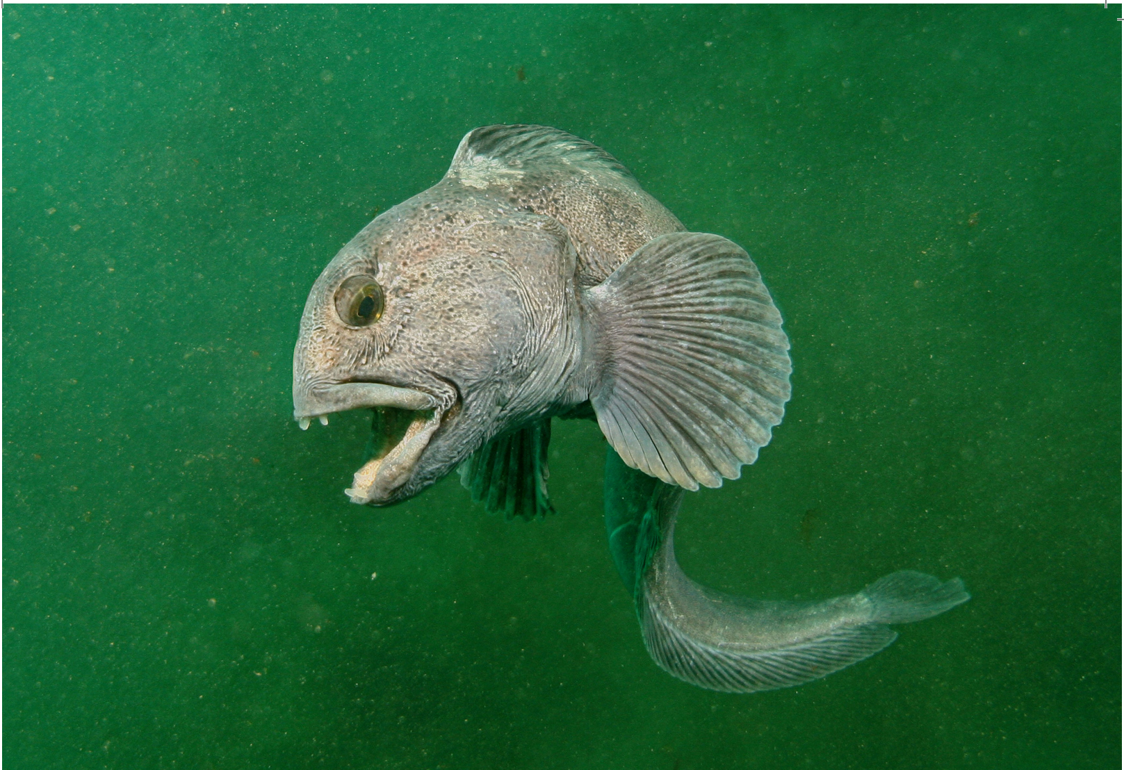
Atlantic wolffish ( Anarhichas lupus ).

general policy goals of sustainable use and conservation of species and habitats (or biodiversity for short). This task has two main steps. The first is to formulate ecological objectives for species and habitats; e.g. how large should animal populations be to be safe, viable and productive, and how much of habitats should be protected and in what condition should they be maintained? The second step is to translate these objectives into clear management objectives and/or management options and actions. This translation would often be best done in a scientific advisory process institutionalized as part of the EA to management and with stakeholder participation.