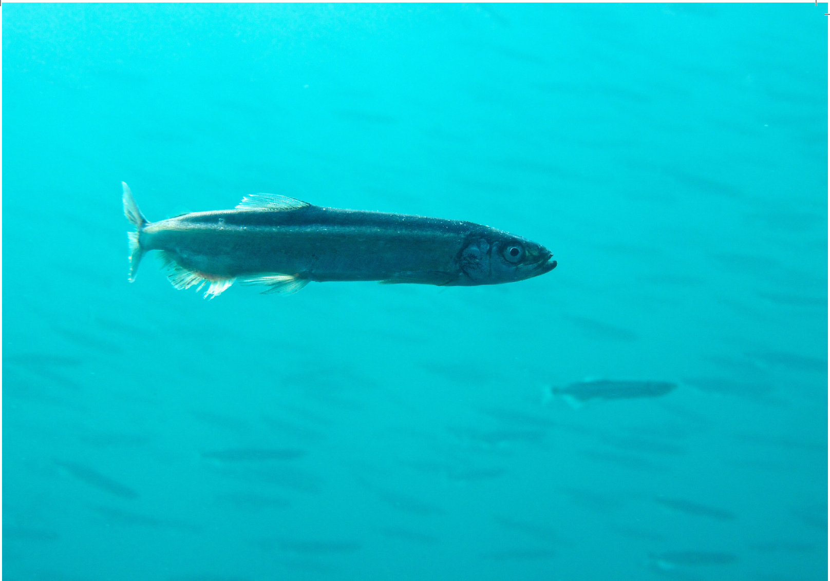
Capelin ( Mallotus villosus) returning from the Arctic waters to spawn in warmer waters

PAME International Secretariat Borgir, Nordurslod Akureyri, Iceland Tel: +354 461-1355 Email: pame@pame.is Homepage: www.pame.is