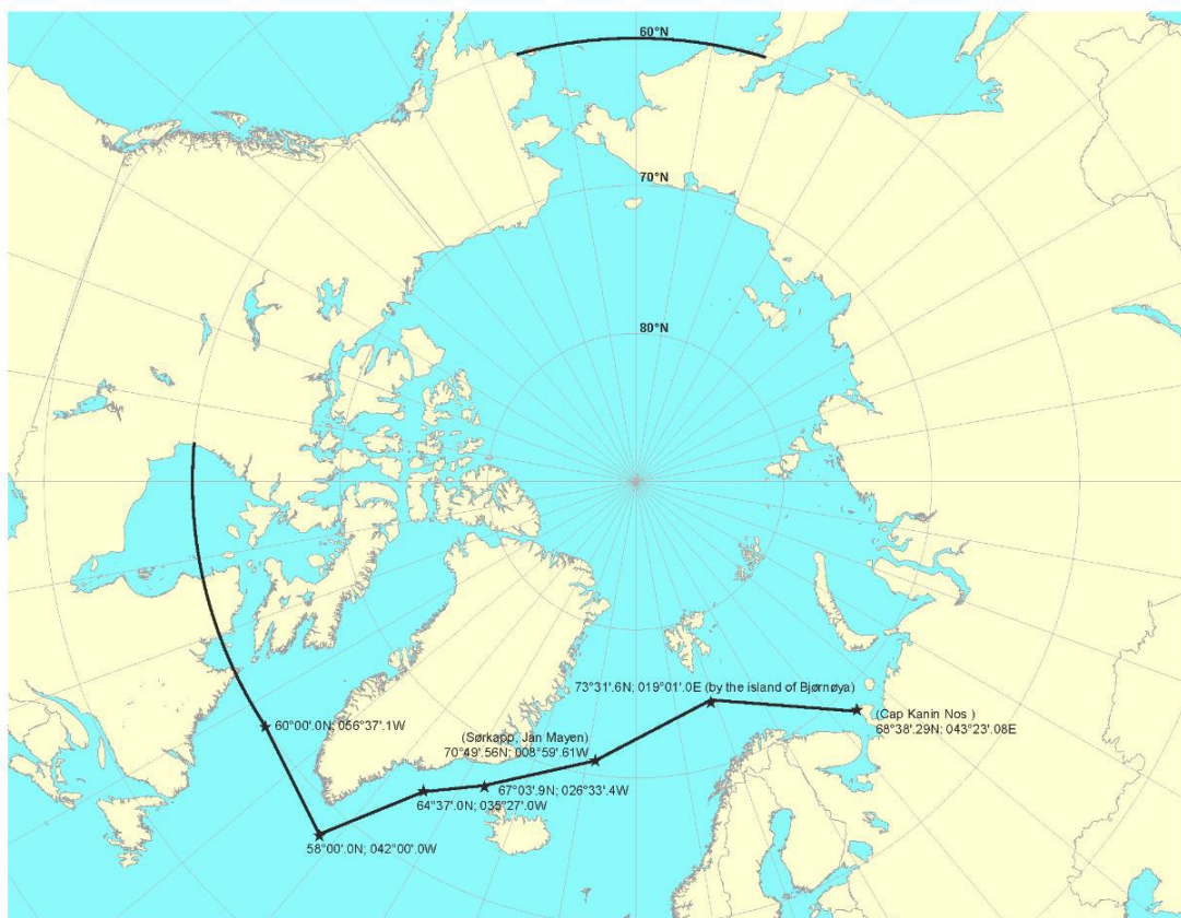
Fig. 1 Resolution MEPC.265(68) 15 May 2015.

“For the purposes of the Polar Code, Arctic waters means those waters which are located north of a line from the latitude 58°00′.0 N and longitude 042°00′.0 W to latitude 64°37′.0 N, longitude 035°27′.0 W and thence by a rhumb line to latitude 67°03′.9 N, longitude 026°33′.4 W and thence by a rhumb line to the latitude 70°49′.56 N and longitude 008°59′.61 W (Sørkapp, Jan Mayen) and by the southern shore of Jan Mayen to 73°31′.6 N and 019°01′.0 E by the Island of Bjørnøya, and thence by a great circle line to the latitude 68°38′.29 N and longitude 043°23′.08 E (Cap Kanin Nos) and hence by the northern shore of the Asian Continent eastward to the Bering Strait and thence from the Bering Strait westward to latitude 60° N as far as Il'pyrskiy and following the 60th North parallel eastward as far as and including Etolin Strait and thence by the northern shore of the North American continent as far south as latitude 60° N and thence eastward along parallel of latitude 60° N, to longitude 056°37′.1 W and thence to the latitude 58°00′.0 N, longitude 042°00′.0 W.”